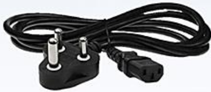
1 x Cord