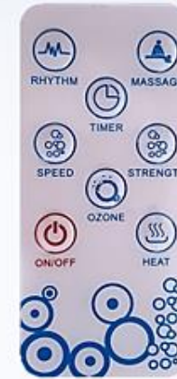
1 x Remote Control