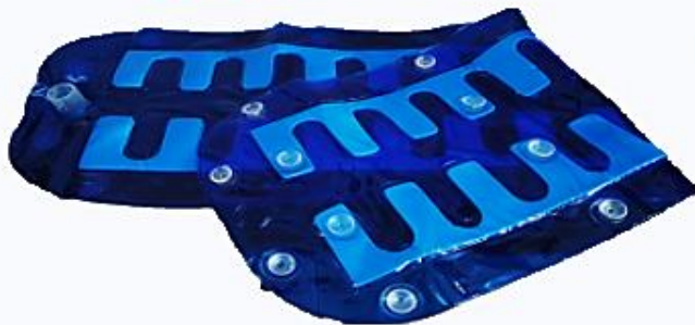
1 x Diffuser Bath Mat