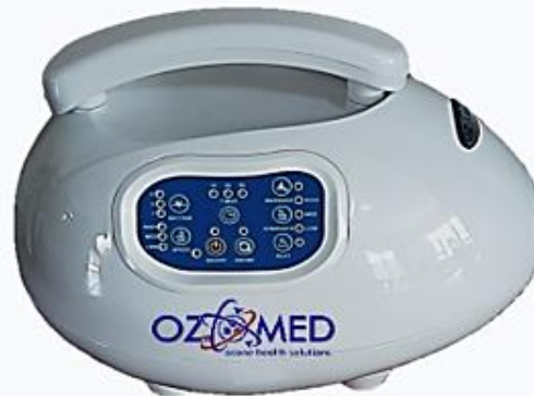
1 x Ozone Blower Unit