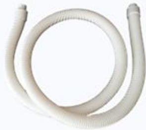
1 x Hose