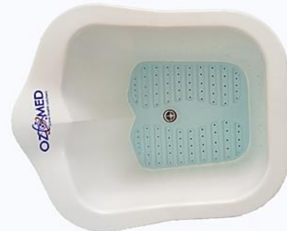
1 x Foot Spa Receptacle